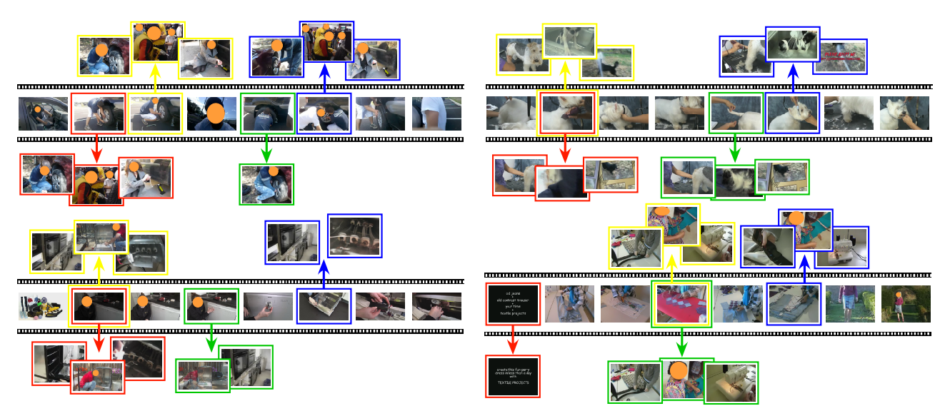
Figure 3: Qualitative visualization of results. Individual images denote the center frame from an eight second window. Each subfigure shows frames from a testing video along with frames from the three support vectors that produce the overall best match to that test video (i.e., frames from only three support vector videos are shown for each test sequence). For a test video, the K=4 frames that were latently selected are highlighted with colored boxes, where color denotes the particular scene type model. Latently selected frames from the top three support vectors are grouped using colored boxes, where color corresponds to the same scene types selected for the test video. From top-to-bottom, left-to-right, the testing videos correspond to changing tire (E7), grooming animal (E10), repairing appliance (E14), and sewing project (E15). Faces have been obscured for privacy considerations. Best viewed magnified and in color.

are inherent in unconstrained internet videos. Additionally, since multiple feature types are required to attain state-of-the-art performance on TRECVID MED11, a principled approach to feature fusion via multiple kernel learning with structured latent variables is proposed. Experimental results showed that this approach outperforms state-of-the-art baselines on the challenging TRECVID MED11 dataset.